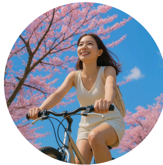
Club Care Worldwide Travel Insurance