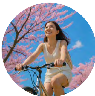
Club Care Worldwide Travel Insurance