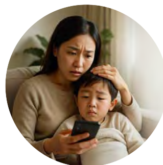
Free 3-day Basic Prescribed Medicine and Standard Delivery Service for The First 3 Designated Local Video Consultations