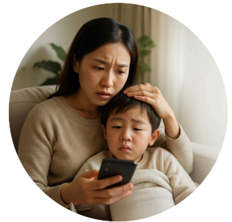
Free 3-day Basic Prescribed Medicine and Standard Delivery Service for The First 3 Designated Local Video Consultations