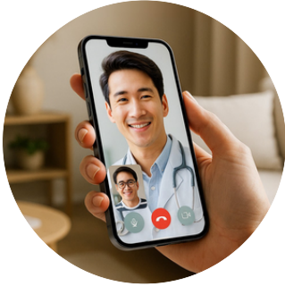
Local Video Consultation