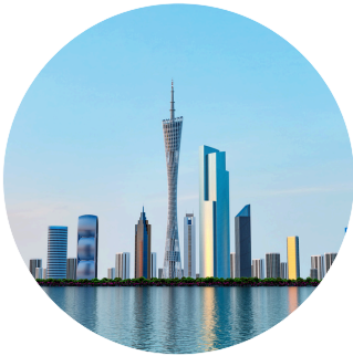
GBA Video Consultation and In-person Clinic Discount