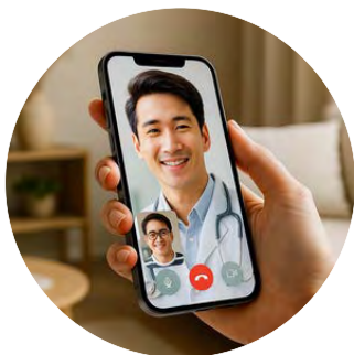
Local Video Consultation