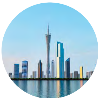
GBA Video Consultation and In-person Clinic Discount